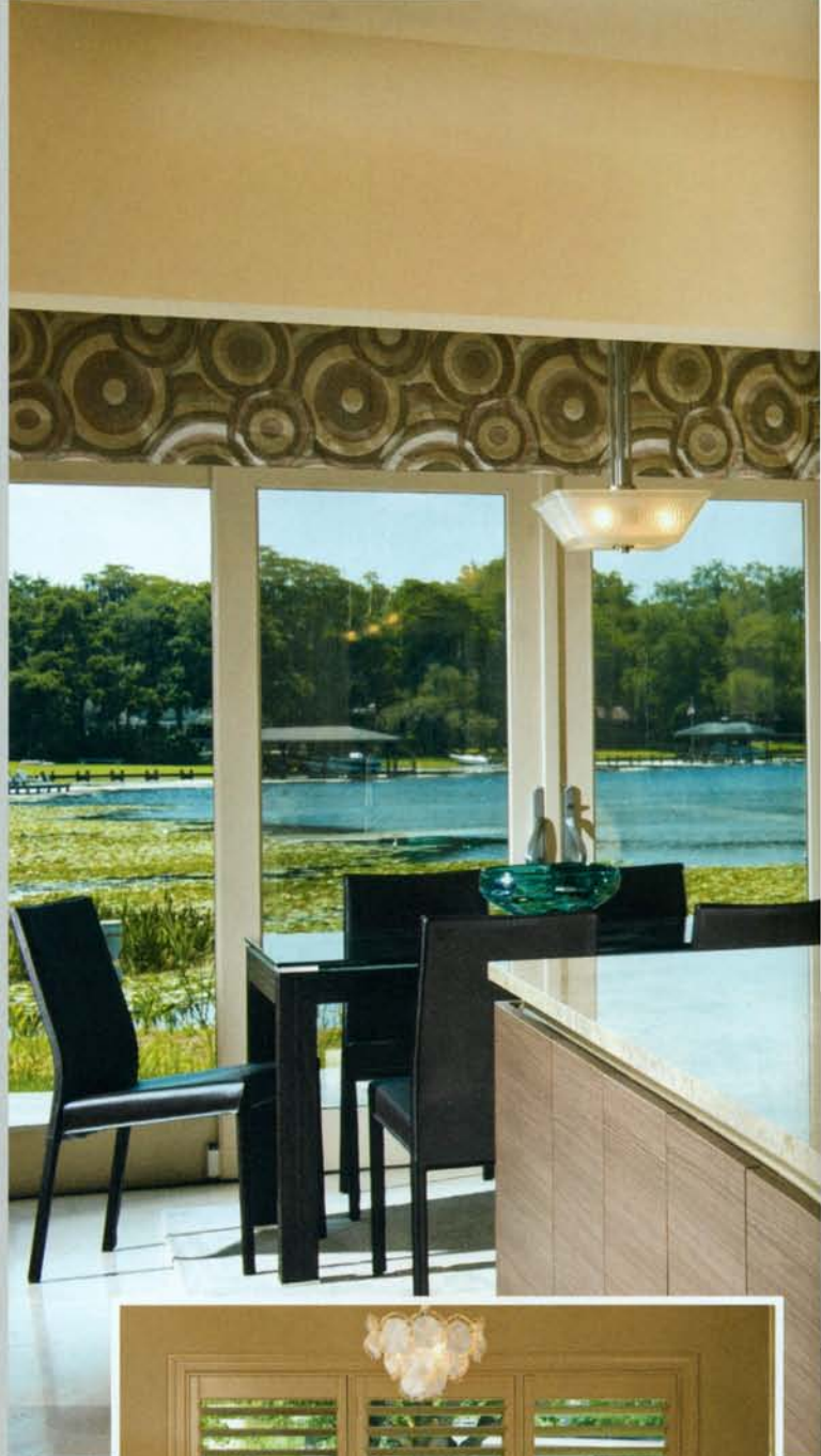
Table and Chairs – Tonin Casa, Italy Rug – Calvin Klein Lighting – George Kovacs Art Glass – Client, Private Collection Drapery – Custom designed by C & L Studio, Inc. Cooktop, oven, convection microwave – Wolf Refrigerator/freezer, dishwasher – Miele Sink – Elkay Faucet – Kohler Simplice