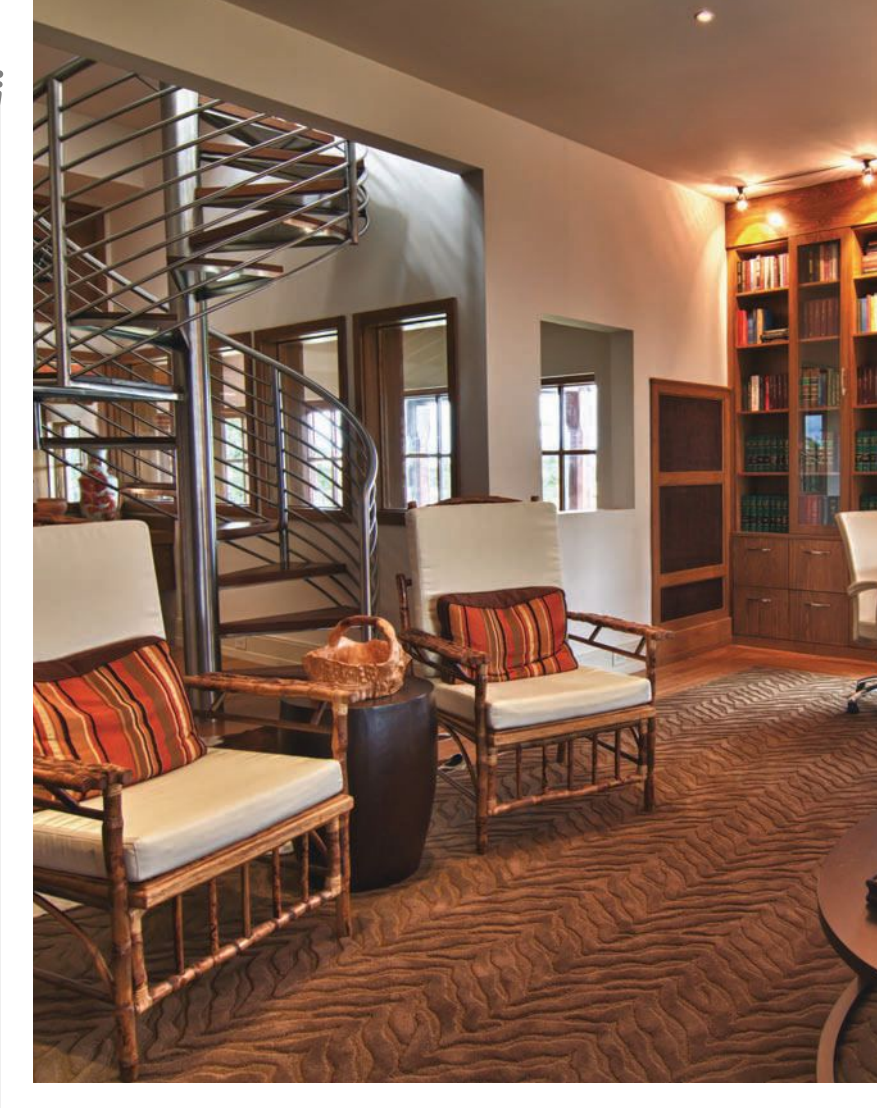
"The library has a lot of versatility. You can relax in here or have a meeting. It works well for most uses."